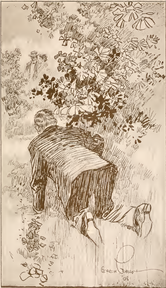
JOHNNY SAW THEM COMING, AND THE IRON TWISTED IN HIS WOUND.